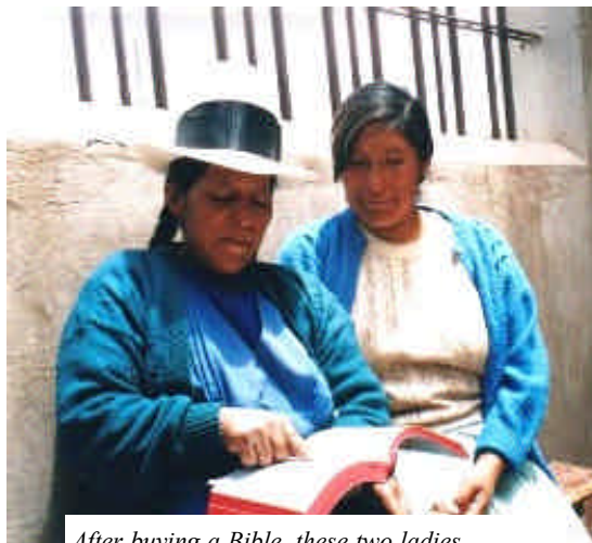
After buying a Bible, these two ladies promptly sat down and began reading.

the equivalent of $8.00 USD, a great amount of money for rural Quechuas. Out there, that is all they can get for a sheep. They get $.80 USD for a sack of potatoes. Some people said they did not even have the subsidized price of $2.80 USD, but borrowed the money in order to pay for the Bible they had ordered.