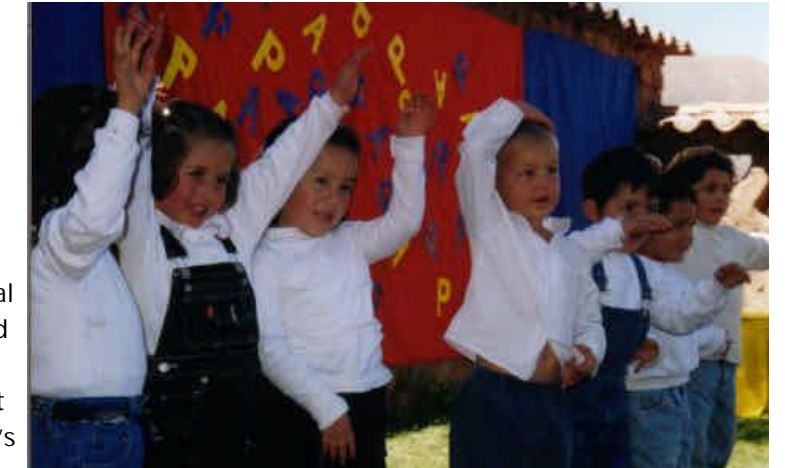
Doing a little dance at the Father's Day party

Here in Peru we call our teachers "profesora." Usually we just say "profe", for short (pronounced 'pro-fay'). I am learning to speak Spanish since that is what all my friends and my teachers speak. I love going to preschool to play with my friends. We do lots of fun things there like sing, dance, play musical instruments, drama, art, story-time, field trips, and even family events. Daddy helped organize the Mother's Day event and Mommy helped organize the Father's Day event.