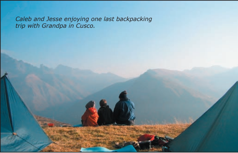
Caleb and Jesse enjoying one last backpacking trip with Grandpa in Cusco.