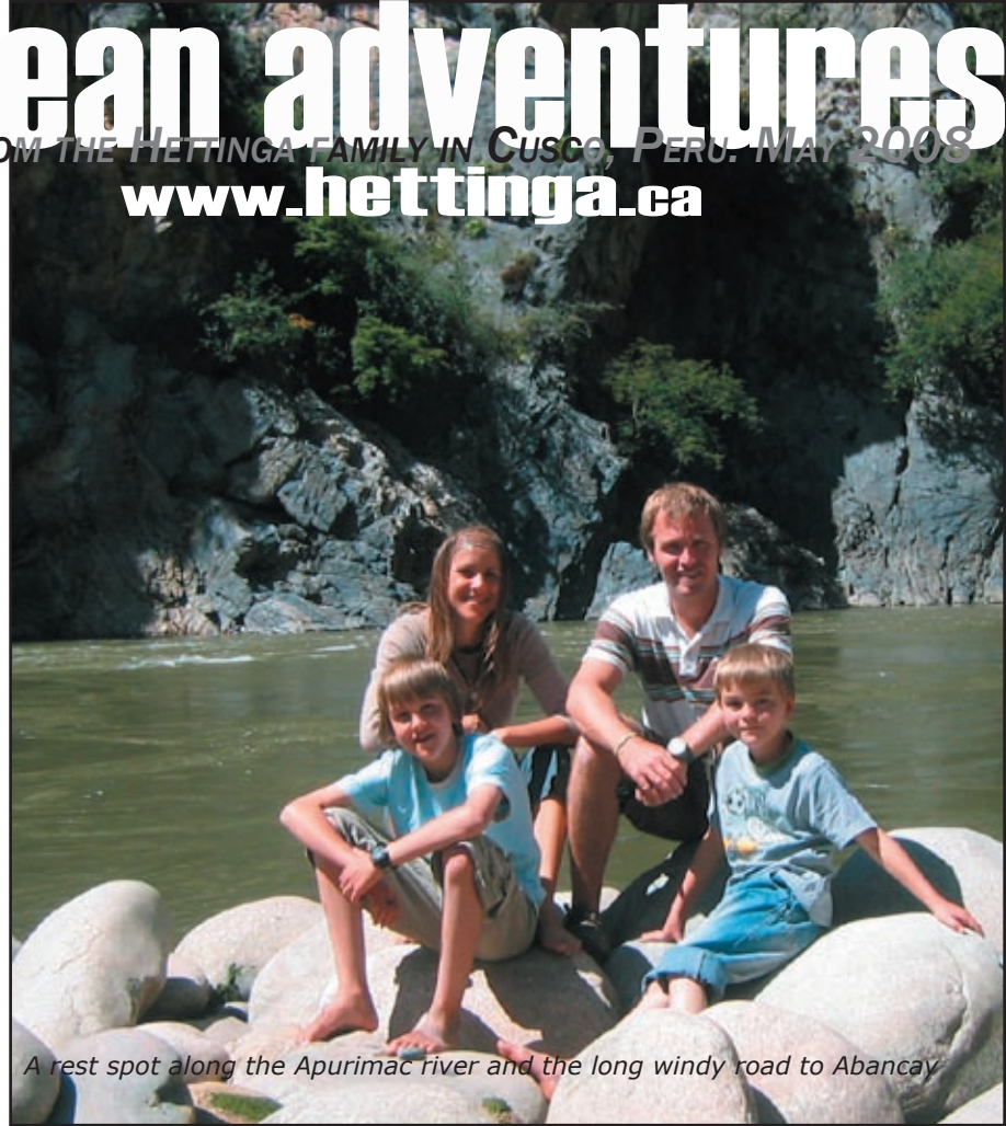
A rest spot along the Apurimac river and the long windy road to Abancay

We are here to BUILD CAPACITY into the Quechua Church of southern Peru, until the year 2010, in LIFE-CHANGING and SUSTAINABLE use of the QUECHUA SCRIPTURES .