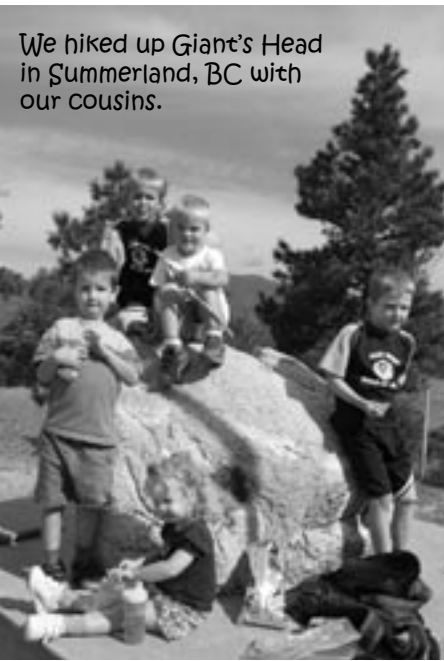
We hiked up Giant's Head in Summerland, BC with our cousins.