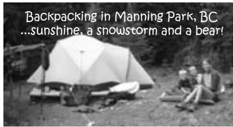
Backpacking in Manning Park, BC ...sunshine, a snowstorm and a bear!