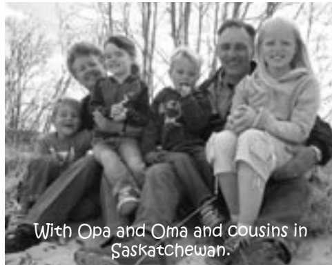
With Opa and Oma and cousins in Saskatchewan.